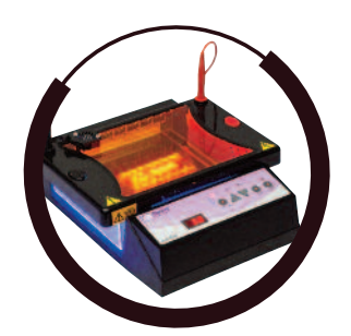
fit the bluVIEW lid and start the run to observe band in real time