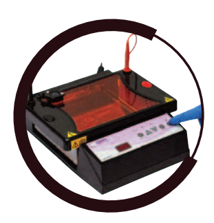
load samples as with the standard MSCHOICE tank