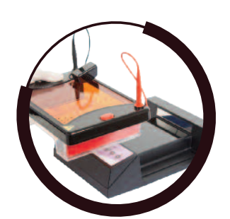
place the gel tank and agarose gel onto the base station

runVIEW is an innovative system that combines blue LED lighting and an inbuilt power supply to create a real time electrophoresis system giving you near instant verification of results. It is perfect for saving time in quick sample check or for teaching the principles of electrophoresis.