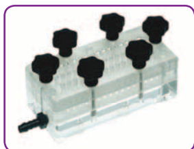
Dot & Slot Blotter