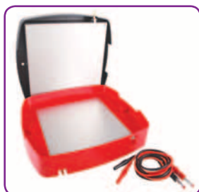
Semi Dry Blotter