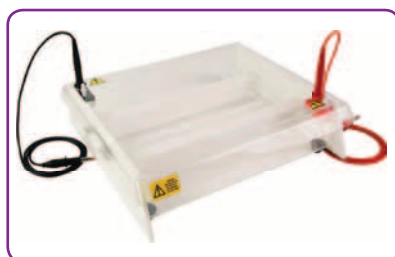
Cellulose Acetate Electrophoresis