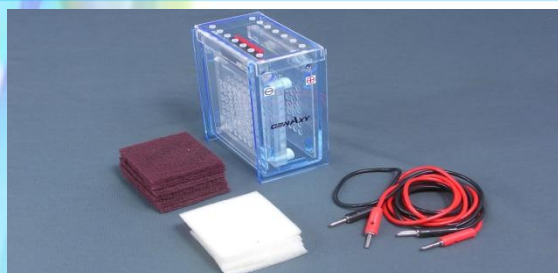
ELECTRO TRANSFER SYSTEM

GENECO-ET is an effective Electro-Transfer Application System, including main one acrylic blotting tank, one gel cassettes, 6 fiber pads, 12 cushion pads & connecting cord.