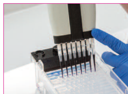
load using a multichannel pipette