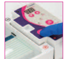
start the run