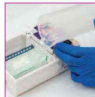
place tray in unit and cover with buffer