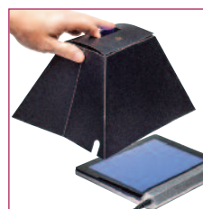
Supplied with a flatpack hood