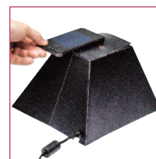
Use your phone to capture an image