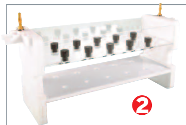
Capillary IEF module, VS10WDCI