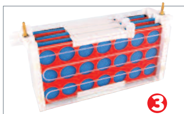
Western Blotting module, VS10WBI