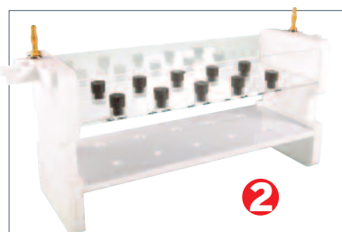
Capillary IEF module, VS10WDCI