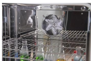
Motor Fan for Forced Air Circulations