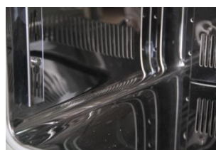
Coved Corner for Easy Cleaning